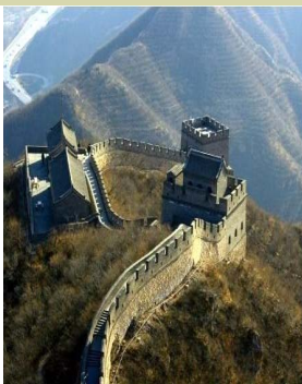
SC SWCS Chapter helps an FFA student from SC visit the Great Wall of China. See inside for complete story.

The SC Chapter had a great year, and was able to increase membership from 92 to 108 members. Communications among chapter members was improved with a new email account, and the Chapter awarded three scholarships to outstanding students wishing to pursue careers in natural resources education. The Chapter also sponsored FFA students, and helped sponsor meetings of the Community Open Land Trust (COLT) and the 2009 South Carolina Conservation Partnership Conference. During the January 2009 Partnership Conference, the Chapter hosted a one-day symposium and held a one day symposium to educate people on Simple Ways to Save Money on the Farm . Thanks to all our members for helping us to grow and strengthen the SC Chapter this year, and we look forward to another great year in 2010!